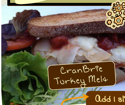
CranBrie Turkey Melt