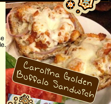
Carolina Golden Buffalo Sandwich

2 slices of our garlic bread with melted mozzarella cheese.